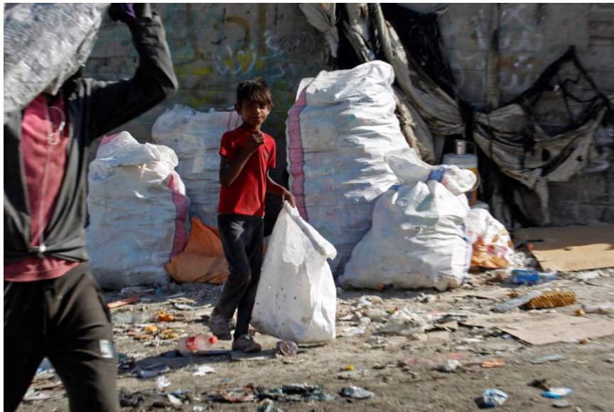
Iraqi boys collect recyclable trash at a dump in Najaf, Iraq.

"We cannot be disconnected from reality," he said. "This is a reality you must keep in mind."