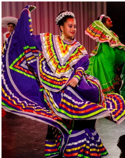
Dance and pageantry were a part of the day's festivities at the Shrine.

The Mexican folklore could not be missing! It was an afternoon full of color, gratitude, and hope in the Patron Saint of Immigrants. There was a beautiful cake with the image of Mother Francesca Cabrini and a toast in honor of our immigrants and refugees from all over the world.