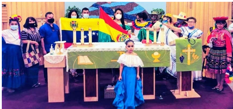
Members of the Hispanic community gathered around the altar at the Mother Cabrini Shrine on Cabrini Day.

Our hearts were filled with joy when we learned of the decision of the State of Colorado to dedicate an annual holiday on the first Monday in October to Mother Cabrini, the Patron Saint of Immigrants, [especially during] this Hispanic pride month! We felt even more joy when the Hispanic people themselves took the initiative to celebrate Cabrini Day at the Mother Cabrini Shrine in Golden, CO – in a manner, of course, in compliance with the norms dictated by the pandemic.