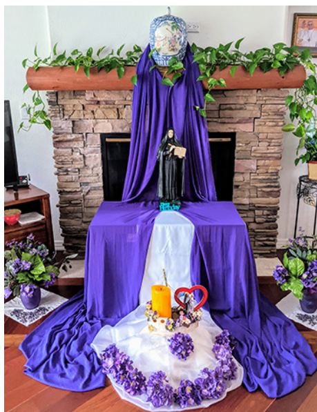
Photo left: The Holy Spirit Community in Denver celebrated the 170 th birthday of Mother Cabrini by creating a beautiful shrine in her honor.