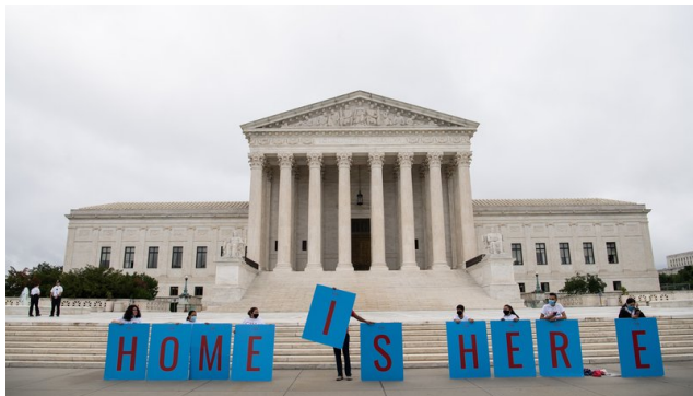
DACA advocates outside the Supreme Court following the Court's decision.