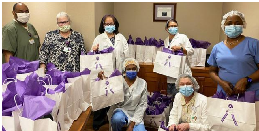
Goodie bags were distributed to all nurses at Cabrini of Westchester to celebrate National Nurses Week.

It is so important to recognize Cabrini of Westchester's nurses at all times, but most especially during the unprecedented COVID-19 pandemic. Each