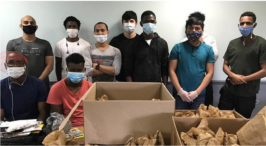
VHH residents have packed over 500 lunches for day workers struggling during the pandemic.

It's always hopeful when you can find something GOOD that comes out of the challenging times we are living through now. The young men of Viator House in Chicago are reaching out to other immigrants in our country who are struggling to support their families as day laborers. While “stuck” at home these young men have been packing over 100 lunches a week. The lunches are taken to the day laborers by two equally dedicated