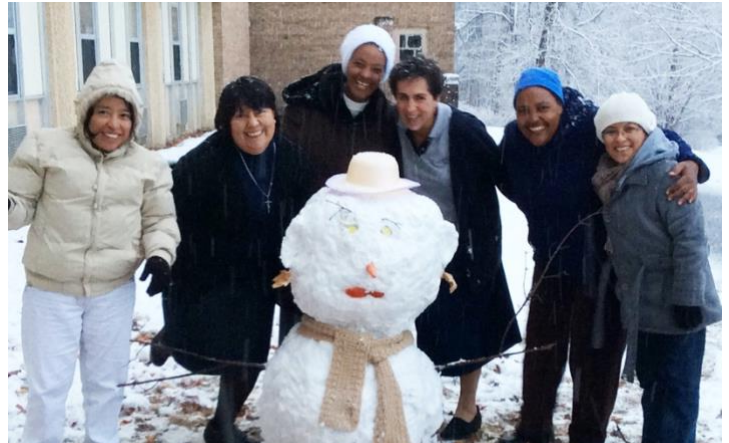
Some MSC newly professed sisters and novices have fun with Mr. Snowman in West Park, NY.