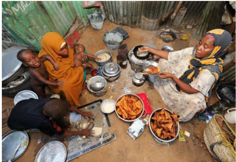
An internally displaced Somali woman and her children prepare their meal at a makeshift camp in Mogadishu, earlier this month during the COVID-19 pandemic.