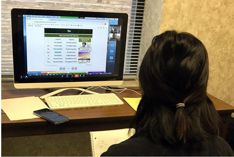
Tutoring continues at Bethany House through on-line learning.