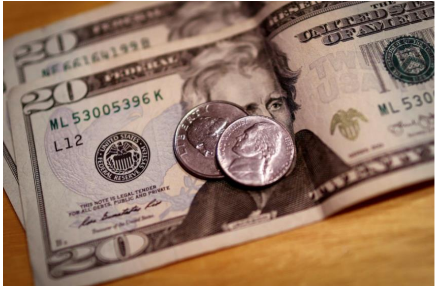
The U.S. Department of Education said that federal financial relief for coronavirus for higher education is meant for U.S. citizens, prompting protests from DACA students.

DACA students, brought to the U.S. illegally as children, do not qualify for emergency aid Education Department officials said on April 21, the same day U.S. Secretary of Education Betsy DeVos announced an additional $6.2 billion in federal funds to higher education institutions.