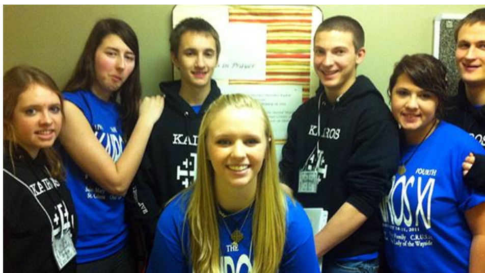
In a photo taken prior to the Coronavirus pandemic, a group gathers at the Cabrini Retreat Center for their Kairos Retreat. Here they are checking the bulletin board to become better acquainted with the Missionary Sister Prayer Partner who will be especially mindful of and holding them in prayer during their retreat.