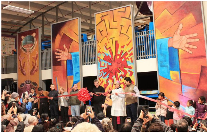
Just last month, with great festivity, the Kino Border Initiative inaugurated their new center. Now this are very different.

“We’re really trying to do all we can to mitigate the risk as much as possible,” Fr. Carroll said, “but we are going to continue to serve the migrants here.”