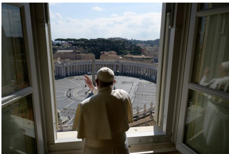
Standing in the window of the Apostolic Palace overlooking an empty St. Peter's Square, Pope Francis blesses the city of Rome still under lockdown to prevent the spread of the COVID 19.

He was also asked if he was an "optimist" when it came to how the world would be after the current crisis is over.