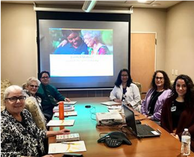
The management and clinical staff of Cabrini of Westchester attend the introductory session for Comfort Matters .

Cabrini of Westchester [in Dobbs Ferry, NY] was awarded a grant to enhance Cabrini's Dementia program on its Garden Level, the memory care unit for residents with moderate to severe dementia. Awarded by The Mother Cabrini Health Foundation in December 2019 in the amount of $40,000, the grant is designed to provide staff with additional training and equipment that will improve the quality of life for the residents.