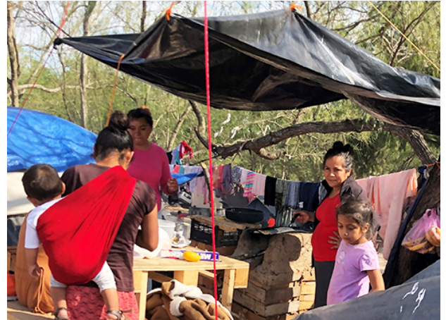
Trying their best to make a home out of a tent, parents are facing challenges in caring for their children in such difficult conditions.