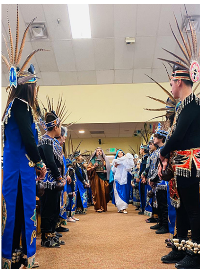
Aztec dancers provide a regal welcome for the baby Jesus.

*An Akathist Hymn (Greek: Ἀκάθιστος ὕμνος, "unseated hymn") is a type of hymn usually recited by Eastern Orthodox or Eastern Catholic Christians, dedicated to a saint, holy event, or one of the persons of the Holy Trinity.