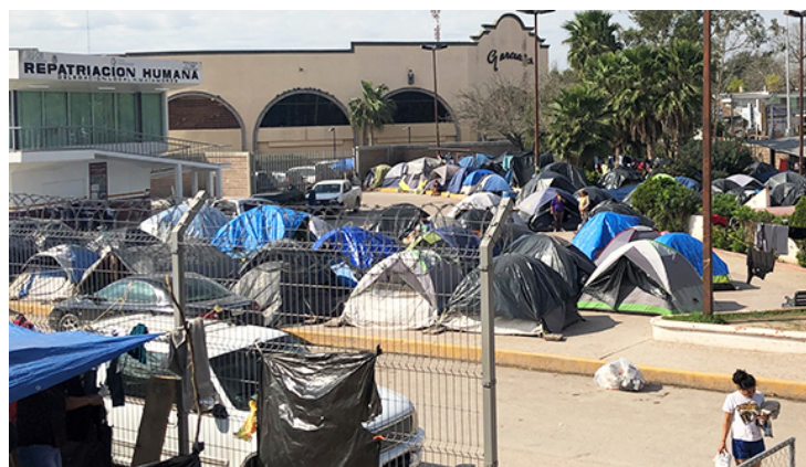
A tent city that has grown in Matamoros, Mexico right across the U.S. border.

In short, asylum seekers wait in Mexico without access to family, legal, or social support. As we are told, as of August 2019, over 98 percent of those subject to this policy have not been able to