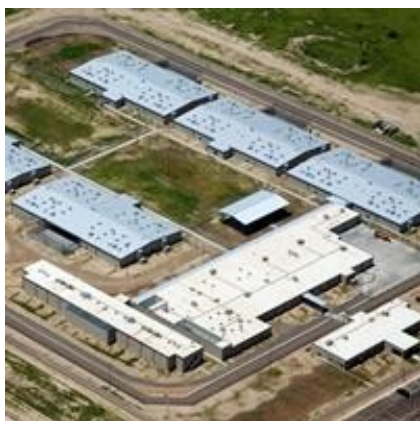
Rio Grande Detention Center, Laredo, TX

In 2019 the Cabrini Mission Foundation expanded its work with immigrants by visiting the border city of Laredo, TX and partnering with a shelter which receives immigrants and asylum seekers once they are released from United States detention centers.