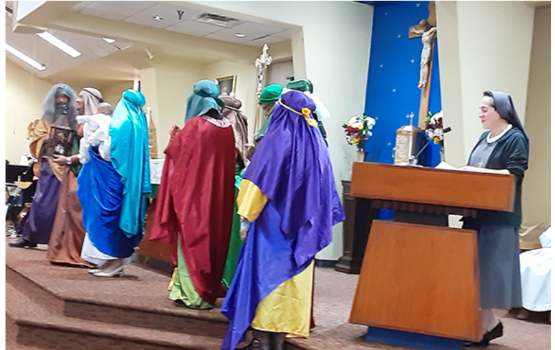
Photo below: Mary and Joseph, Simeon and Anna bring forth the child Jesus to be presented.