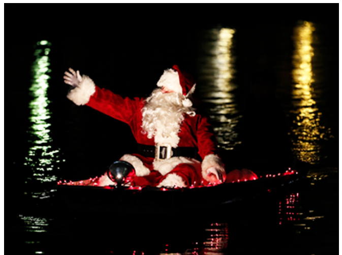
Candlelight caroling signals the arrival of "you know who" on the bayou!