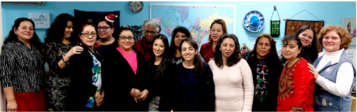
Cabrini Immigrant Services in Dobbs Ferry hosted a Christmas party for the Cabrini Moms. Native dishes were served and recipes were shared making for a festive evening.

We had a special Christmas dinner for some of our Moms. They were so happy as they shared their different dishes from their home countries. There was much joy and laughter as they shared stories and recipes, etc. The Moms also had a Secret Santa. It was touching as each person got up and said some beautiful things about the person for whom “Santa” bought a gift. It was a delightful evening for all and the Moms enjoyed having some time to share with friends during the holidays.