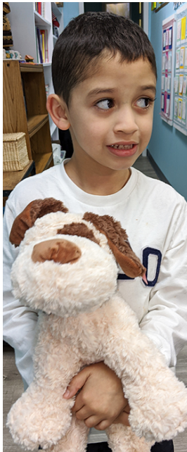
This Cabrini youngster received a new little friend from Santa.