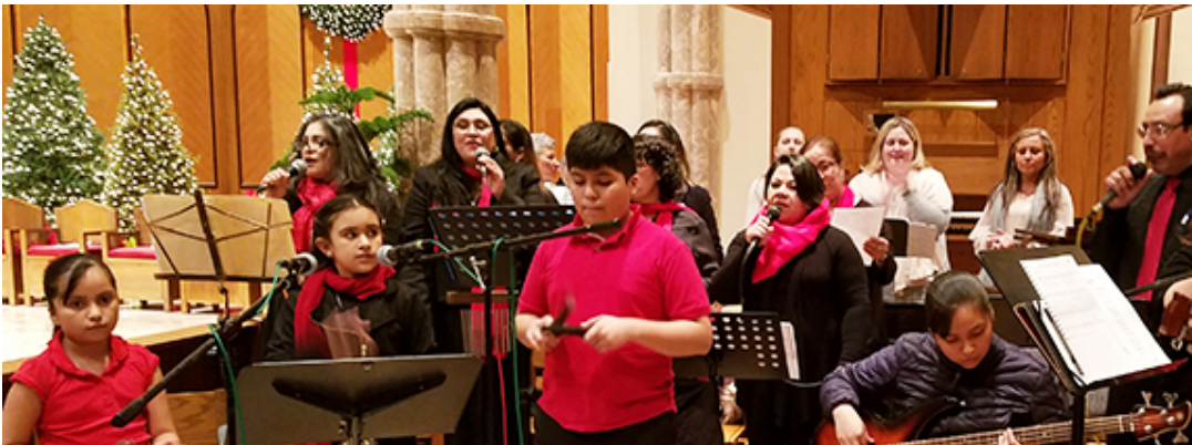
The Spanish Choir performs during the Mass at Holy Name Cathedral.

Cardinal Blase J. Cupich, Archbishop of Chicago stated, “These days also highlight how the world’s refugees in our day experience the same struggles of the Holy Family, who had to flee violence and travel to a foreign land for safety.”