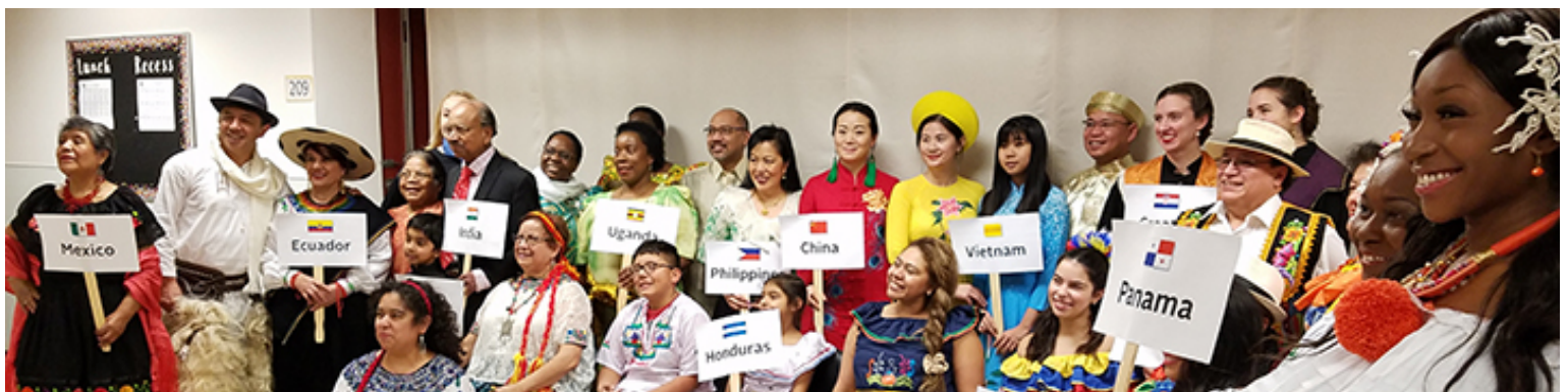
Immigrants from over 30 countries proudly wear their colorful native dress for the special Mass.