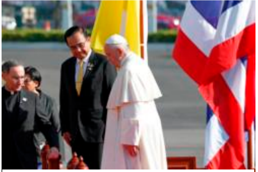
Pope Francis and Thailand’s Prime Minister Prayut Chan-o-cha attend a welcoming ceremony in the courtyard of the Government House in Bangkok.

“Our age is marked by a globalization that is all too often viewed in narrow economic terms, tending to erase the distinguishing features that shape the beauty and soul of our peoples,” he said. “Yet the experience of a unity that respects and makes room for diversity serves as an inspiration and incentive for all those concerned about the kind of world we wish to leave to our children.”