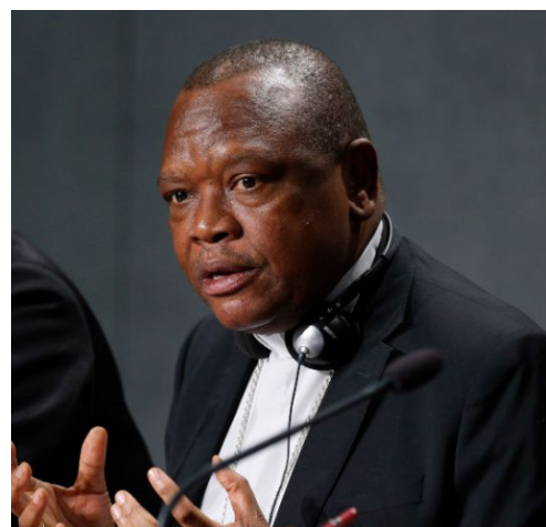
Cardinal Fridolin Ambongo Besunga of Kinshasa, Congo speaks after a session of the Synod of Bishops for the Amazon.