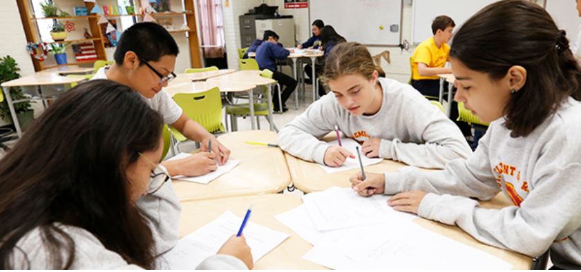
Individual and team math calculations were part of the competition and fun of the math tournament at Cabrini High School.