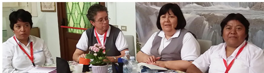
The workshop brought with it time for small group discussion and sharing.

During these three weeks we have contemplated wonderful historical events of the life of Saint Francisca Cabrini, the process of biological, psychic, intellectual and spiritual growths that integrated the Woman, saint, founder of our institute. Her value system, her missionary ideal, her relationship with Jesus.