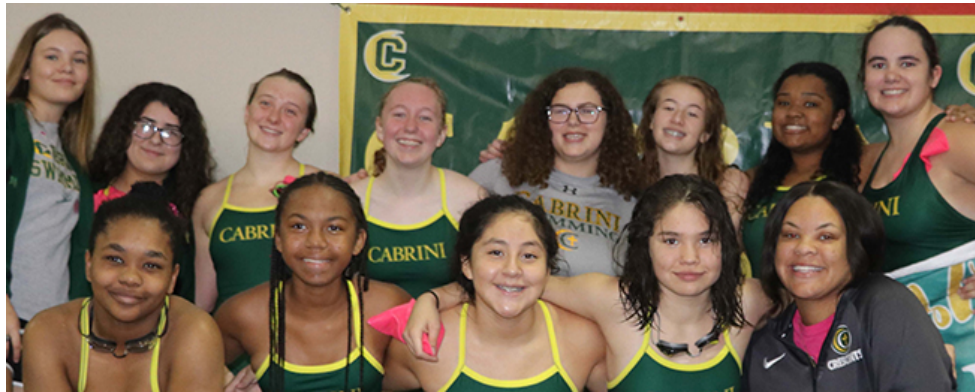
The Cabrini High School Swim Team helps to raise funds for cancer awareness.

All funds from the event were raised through donations, admission tickets, heat sheet sales, raffles, and auctions. All funds raised will be donated to the Tulane Cancer Center.