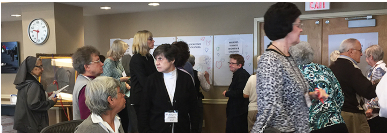
Based on previous survey results, Chapter participants were asked to draw a heart on their top three mission priorities.

During this important time in the life of the province, mission priorities are discussed and established.