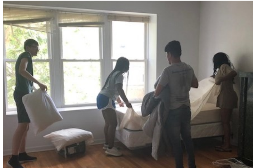
Collaborating with Exodus World Service, the Youth on a Mission group cheerfully pitches in to make comfortable living arrangements for the arriving refugee family.

In a week where ICE raids loomed and harmful rhetoric about immigrants seemed heightened, one of the most meaningful moments of our trip was the opportunity to welcome a refugee family being re-settled. Through Exodus World Service, we arrived at the refugee family's apartment before them and spent the afternoon getting it all set up: beds made, shower curtain hung, furniture assembled, pantry stocked. When the six refugees arrived, we cheered and greeted them with warmth and excitement. For our youth to be able to say things like "we are so glad you're here!" and "our country is better with you as our neighbors!" meant a great deal to us, and helped us live into the country we long for.