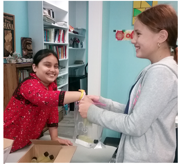
Photo above: Two Cabrini Kids assemble bags for the clients at Westhab, Inc..