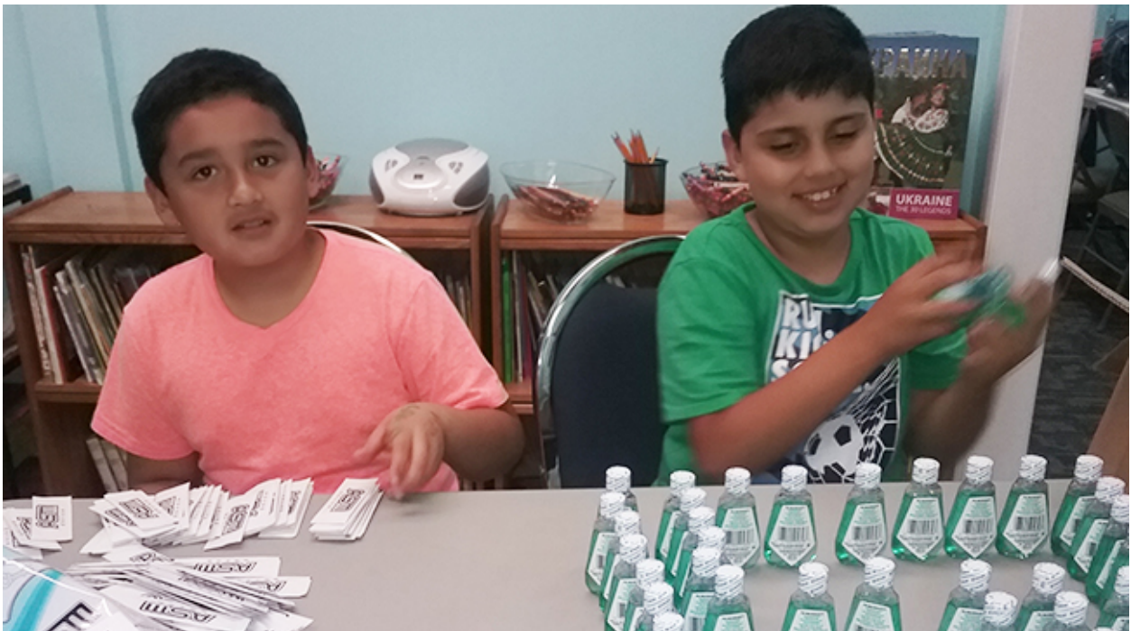
Photo below: Cabrini Kids ready toiletries and hygiene items for insertion into the care bags. What a great way to create awareness in children regarding others’ needs and to involve them in responding.