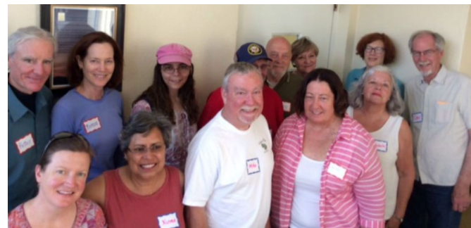
Volunteers from the Bay Area completed training for their time at Annunciation House in El Paso, TX.