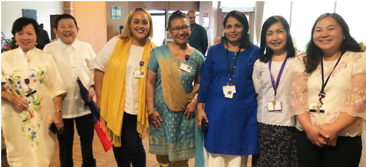
Proudly wearing attire from their native countries, Cabrini of Westchester's staff members gather for a multi-cultural parade.