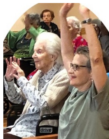
Giving thanks and praise to God!