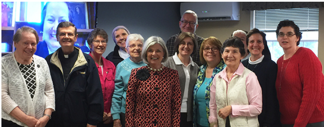
Gathering at the Sisters of the Holy Redeemer, the Delaware Valley Member Area of the NRVC met to review this year's vocation activity and to outline next year's schedule of intercongregational vocation events.

members to join with them in reaching out to others and inviting them to discern God's call in their lives and to extend an invitation to consider religious life as a path. Many of the congregations are asking each of their local communities to plan an event: going to a concert or a movie; hosting a cookout; attending a museum; seeing a play – whatever it might be, and inviting young people to join them in that activity as way of getting better acquainted. Many of the congregations sponsor high schools and/or colleges. The vocation directors encouraged their community members to reach out to these young people so that they might have an opportunity to better know those in religious life.