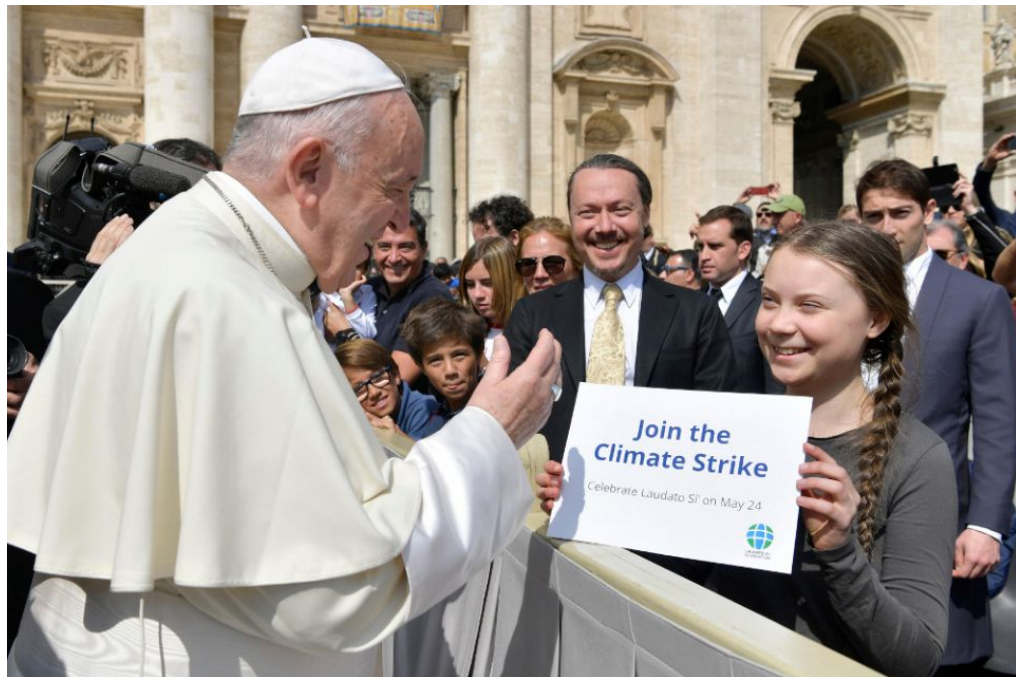
Pope Francis greets 16 year-old climate activist Greta Thunberg during his April 17 general audience at the Vatican.

The world is hungry for courage and commitment. Everywhere Greta walked, ordinary people took pictures by the hundreds. In the Vatican, guards asked for selfies with Greta. Nuns asked for selfies