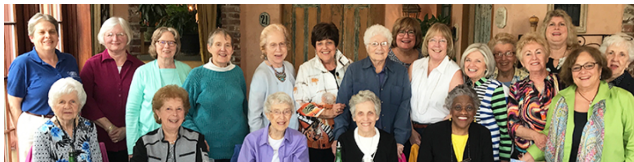
Photo below: Cabrini University is all about lifelong learning and lifelong friendships. Former and current faculty and staff gathered last Friday for their annual end of year luncheon.