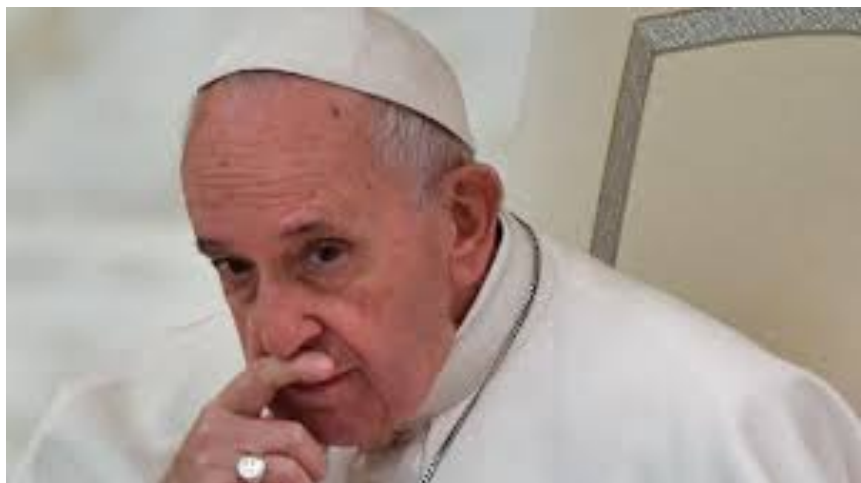
Pope Francis announces new church abuse laws.

It mandates new procedures requiring all priests and members of religious orders to report allegations of sexual abuse or its cover up to their bishop or superior. It establishes protections for those reporting abuse or cover-up allegations, and blocks attempts to silence accusers from speaking about their accusations. It directs archbishops to oversee investigations of other bishops within their ecclesiastical provinces, and sets a timeline of 90 days for reports to be made to the Vatican for final determination. While it encourages lay involvement in such investigations, it does not obligate it.