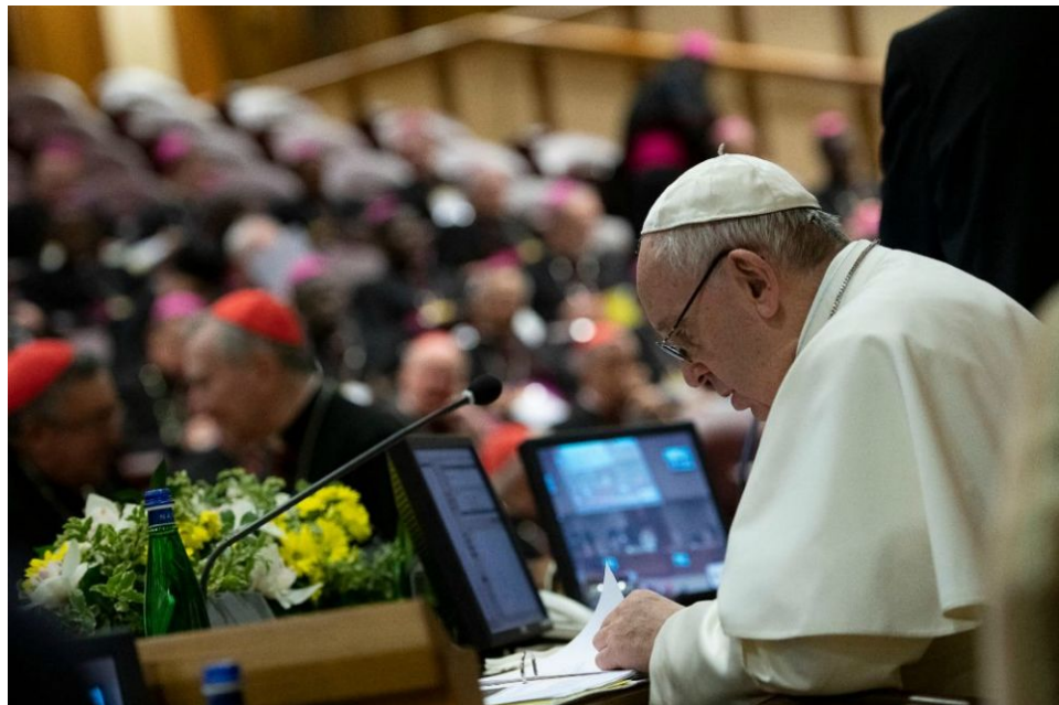
Pope Francis reviews documents during the meeting in the Vatican in February on the sex abuse crisis.

"This is not the bold action that's desperately needed. A law without penalties is not a law at all — it's a suggestion," the Massachusetts-based organization said in a statement. To read the entire article: https://www.ncronline.org/news/accountability/reactions-new-church-abuse-laws-good-step-more-are-needed