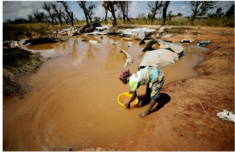
A woman collects water as the floodwaters recede in Mozambique.

"Climate change is now found to be the key factor accelerating all other drivers of forced displacement," she said. According to Rosenhauer, 41 people are displaced each minute somewhere in the world due to an extreme weather event. She said that the United Nations Refugee Agency estimated that nearly 250 million people world wide will be displaced by climate change by 2050.