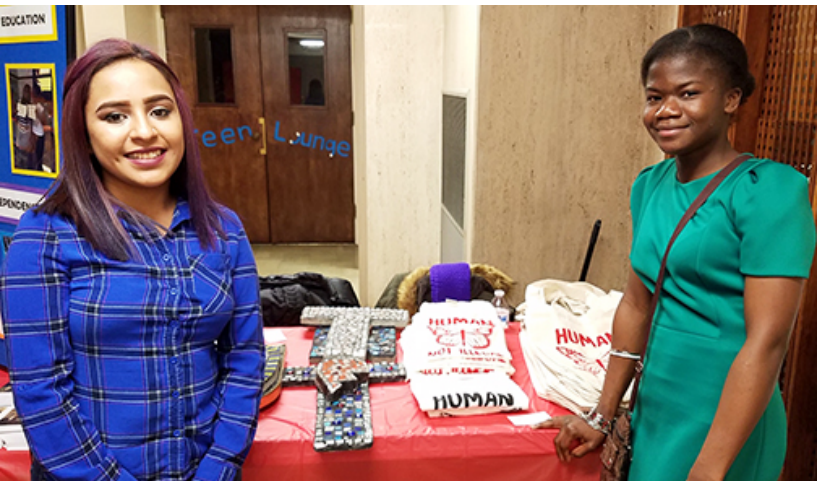
Two Bethany House residents post with their creations which were on sale during the concert.

Admission to the concert was a free-will donation, which was then offered as a gift to Bethany House of Hospitality, a home which offers housing and support to young immigrant women in their journey toward independence.