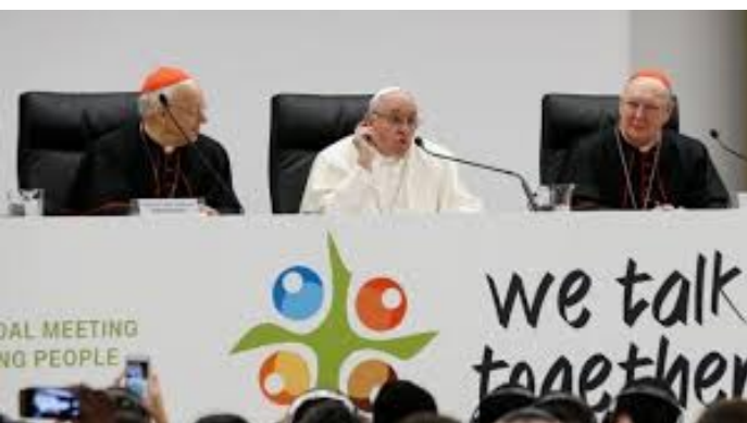
Pope Francis addresses the Synod on Youth.