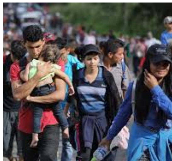
Women and young children make up many of those in the caravan making its way north.

The LCWR and the Franciscan network both denounced statements that insinuated the group of migrants that is made up of people wanting to harm the population of the United States, including some made by President Donald Trump. In its statement, the LCWR said it was "deeply troubled" by the president's "continued denigration of those fleeing untenable situations in their home countries."