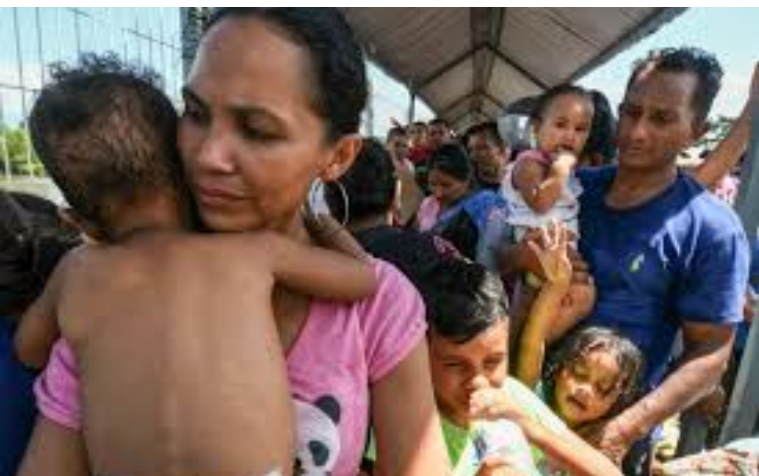
Families are fleeing violence and seeking a better life for their children.

“These are mothers and fathers, sisters and brothers, who have been forced from their homes by unimaginable violence and insecurity; runaway corruption; and droughts and floods linked to climate change, the organization of leaders of women religious said in its statement. “These are women and girls fleeing intolerable situations of domestic violence. These are young men and women who have no access to quality education and no hope of economic opportunity. They are people of hope and promise who only want the opportunity to contribute their toil and talent to this nation.”