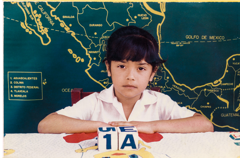
The author, age 8, in elementary school in Mexico.

I learned to speak and write fluent English by 8th grade, and I was determined to excel in school. For survival, there was no other option. My parents struggled to provide the upbringing and education that most American children take for granted. In high school, I excelled in honors and AP courses. I had dedicated, loving teachers who helped me graduate and apply to college.