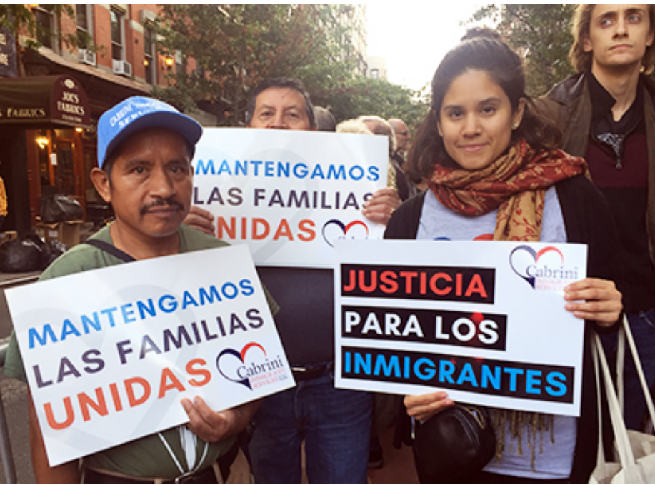
CIS staffers, volunteers and community members rally for support of immigrant families in New York City. Follow CIS-NYC on social media for further details.

CIS-NYC released the following statement on September 24 th and rapidly mobilized community members and staff to stand up against this cruel proposal and educate our community about what the proposal means. In the coming months there will be opportunities for allies to stand up against this proposed change; follow CIS-NYC on Facebook and Twitter @cisnyc for updates and information.