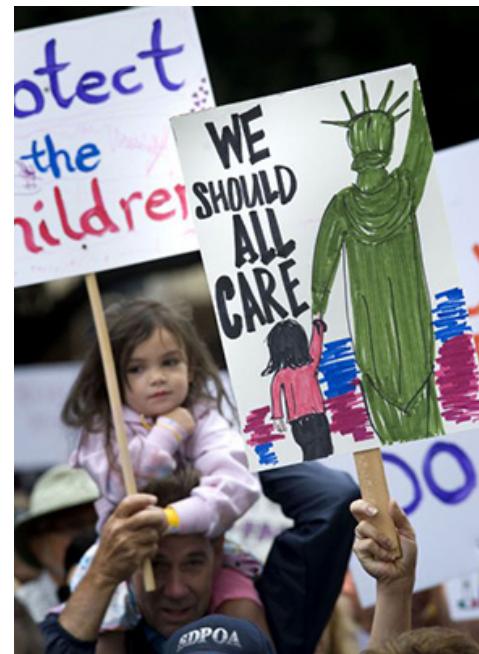
People rally in San Diego on behalf of the families that had been separated at the Mexican – U.S. border.