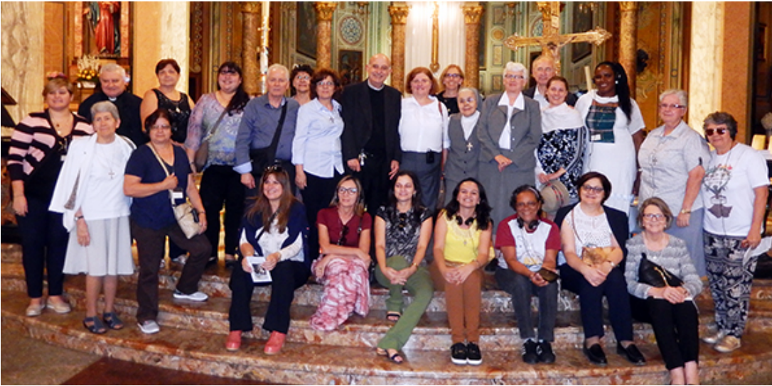
Cabrini Lay Missionaries from various countries in the Institute gathered in Codogno with the Missionary Sisters for a planning meeting. This photo was taken at the Roman Basilica of St. Antonio Abate and St. Frances Cabrini in Sant' Angelo Lodigiano.

“Buon giorno,” “Buenos días,” “Bom dia,” and “Good morning”, were the words that greeted us as began our Cabrini Lay Missionary (CLM) International meeting in Codogno, Italy. CLMs from Italy, Argentina, Brazil, Ethiopia and the U.S. met from April 21 st – April 23 rd . The theme of the 2 nd International meeting was, “Together towards the future: Now is the right time.”