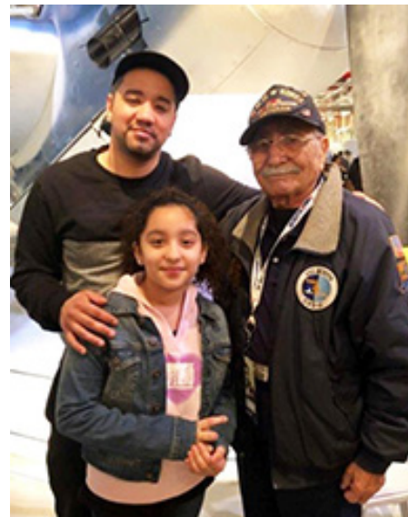
One of the "Cabrini Kids" and her dad (l.) speak with a World War II veteran who served on the Intrepid air craft carrier.