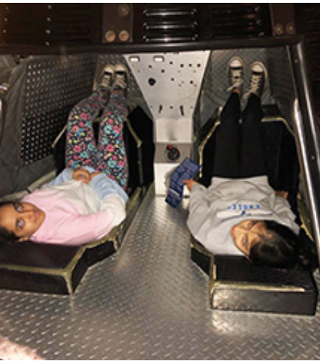
Blast off! Two "Cabrini Kids" take a turn at sitting in the space capsule.

The children were so interested as they used the interactive exhibits located on the ship. They were able to climb into an actual Bell 47 helicopter, steer the wings of an airplane and use different instruments on a submarine such as a periscope. The Cabrini Kids also got to sit inside a space capsule. They loved having to sit a facing up so they could see straight up into the capsule and see the different monitors and instruments.