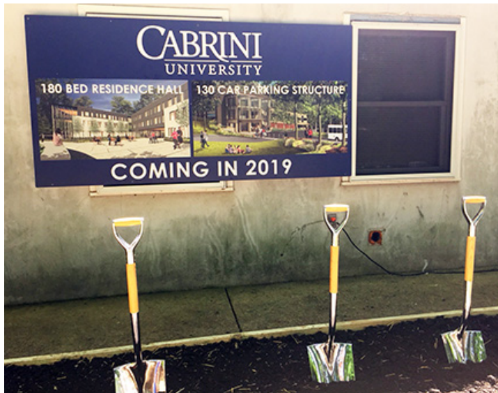
Photo left: Architectural renderings of the new residence hall and parking structure. Construction will begin immediately on the Radnor campus. Completion is anticipated in 2019.