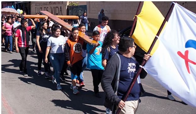
Young people carry the Missionary Cross from World Youth Day to the Dispensary "Madre Cabrini".