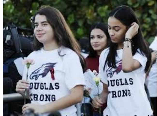
Students returned to class at Marjory Stoneman Douglas High School in Parkland, Florida.

“Our elected officials...must begin the process of walking away from the moral compromises that doom our society to inaction,” he said. ~ excerpts from National Catholic Reporter