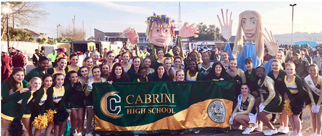
Cabrini High School students and the puppets they created get ready to march in a Mardi Gras parade.

The Cabrini High School Theater Arts Puppet Project, a new school club that creates handmade parade puppets, unveiled their unique works of art on parade routes this Mardi Gras season.