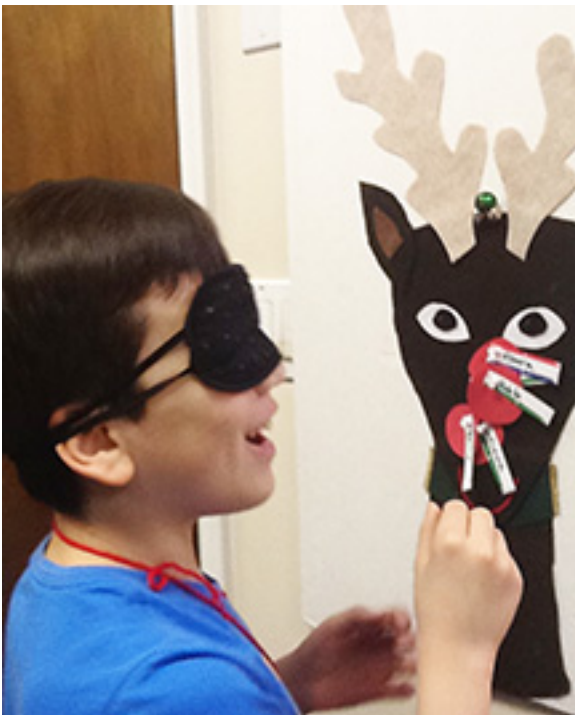
One of the "Cabrini Kids" had great fun pinning the red nose on Rudolph!

At the party, the children made candy canes and wreaths out of pipe cleaners and beads, bell necklaces, played pretzel bingo and had fun playing 'Pin the Red Nose on Rudolph!' After pizza and punch, the children got very excited because they weren't sure if Santa would come especially since some of them put their letters to Santa in the mailbox a little late. When they saw their gifts, their eyes widened, their smiles went from ear to ear and the laughter and excitement spread. As they opened their gifts, you would hear,