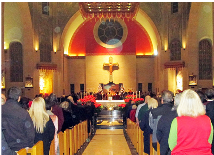
The Shrine Chapel was filled to capacity on Christmas Eve and Christmas Day at the start of the Centenary Celebration.

On Christmas Eve and Christmas Day, the National Shrine of St. Frances Xavier Cabrini began its year-long Centenary Celebration, marking 100 years since Mother Cabrini transitioned to eternal life. The Chapel was filled to capacity on these days. Banners honoring Mother Cabrini and the missions she started around the world were part of the opening and closing processions.