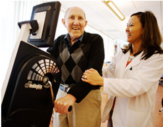
Cabrini of Westchester's Rehabilitation staff work one on one with patients in the program to achieve their optimal level of functioning.

A partnership between White Plains Hospital and Cabrini of Westchester has created a network recognized as one of the nations' top in lung care, and was recently cited as a best practice in transitions of care for pulmonary patients at the recent PointClickCare SUMMIT, a national conference for healthcare professionals.