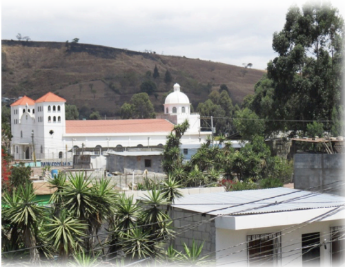
A view of Barcenas from the MSC dispensary.