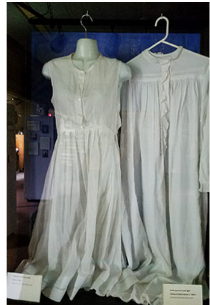
Articles of clothing worn by Mother Cabrini were on display loaned to the Klyne-Esopus Museum by the St. Cabrini Shrine in New York City.

The afternoon ended with an invitation to visit Saint Frances Cabrini Shrine in New York City and pray in the quiet surrounding her remains enshrined beneath the main altar. The invitation was eagerly accepted by everyone there. ~ submitted by Cherie Sprosty