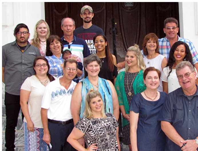
Cabrini High alumnae, spouses, friends and family enjoyed a night of dining on Esplanade Ave.