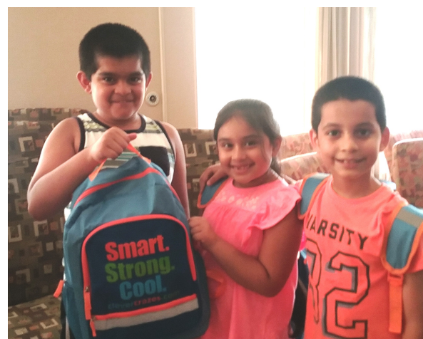
These Cabrini Kids certainly will be Smart/Strong/Cool as they begin school with their nifty new school supplies.

Well, that was not the case at St. Cabrini Nursing Home, Dobbs Ferry, NY when the children and their parents came to receive much needed school supplies. Both parents and children were smiling from ear to ear! Close to 45 Cabrini Kids and their parents looked in amazement when they saw the backpacks, loose leaf binders, notebooks, pens, pencils and pencil cases, folders, crayons, rulers, glue, markers, etc. that were collected for them. The Resident Council of St. Cabrini Nursing Home sponsored this Mission in Action collection for the benefit of the children of Cabrini Immigrant Services. Their families, friends, visitors, as well as staff and the residents themselves contributed to the drive