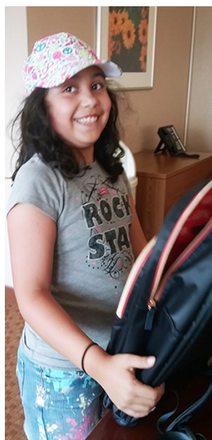
Nothing like a brand new backpack to put a smile on a youngster’s face!