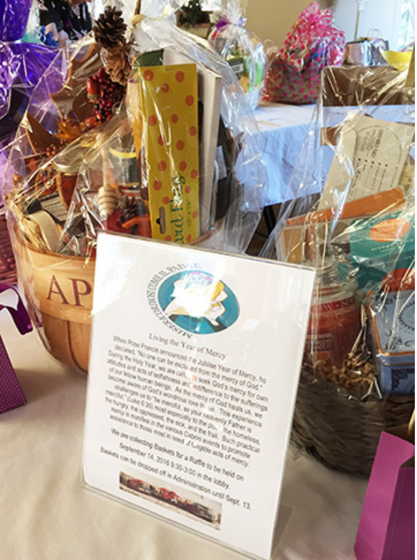
Sixteen beautiful baskets were created for the Year of Mercy to benefit victims of the Louisiana floods.