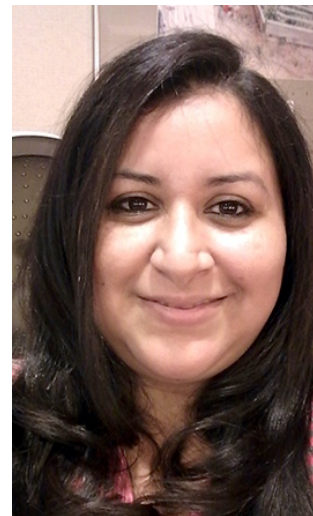
A new hairstyle just makes you smile!