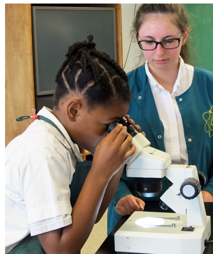
Members of the Cabrini High School Science Squad teach youngsters about the wonders of science.

From chemistry and physics to life and environmental sciences, Science Squad lessons are led by a Cabrini science teacher and team of students. Elementary school teachers simply choose a topic from the Science Squad's menu of lessons or request a topic suited to the needs of the class. The Science Squad will come to the teacher's classroom fully equipped with an engaging activity and all the materials necessary to excite students about science. Or, if teachers prefer, they can bring their class to visit the Science Squad at Cabrini High School for a field trip.