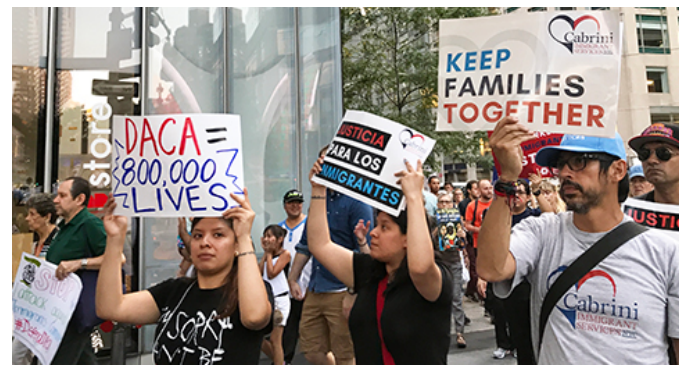
CIS-NYC staffers rally to maintain DACA.

The staff at Cabrini Immigrant Services of NYC has been working hard to respond quickly and effectively to the Trump Administration's recent decision to rescind the DACA (Deferred Action for Childhood Arrivals) Program. This is a decision that puts the lives and dreams of nearly 800,000 young people at risk -- including around 500 people whom CIS-NYC has helped apply for DACA over the last 5 years. In response to this disturbing news we have made our voices heard at local rallies, ramped up our legal and social services for DACA recipients and their families, and prepared a range of resources to address the concerns of our community.