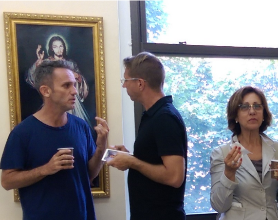
Earlier in August, a group from Codogno, Italy spent time at the Shrine and enjoyed some New York hospitality.