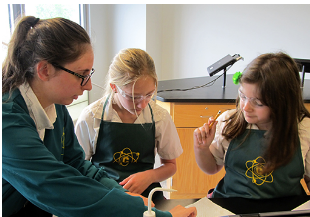
Members of the Science Squad share their love of science with grade school students.

The Science Squad program began as a way for Cabrini High School to help elementary school science teachers by providing equipment and resources they may not otherwise have access to and introducing new and exciting activities to their classroom.