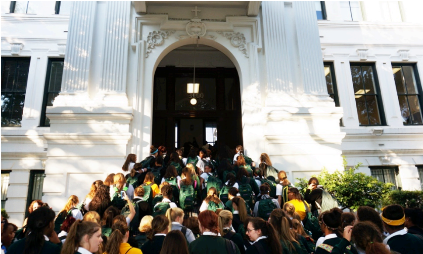
Cabrini High School students recreate the opening of the school following Hurricane Katrina. They walked through the doors of the historic Esplanade building.

Cabrini High School commemorated the ten-year anniversary of Hurricane Katrina with a ceremony depicting the reopening of school after the historic storm.