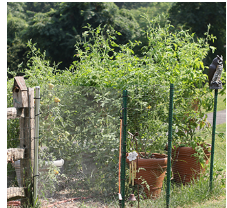
As school reopened in August, due to a summer of abundant sunshine and the TLC of the Cabrini College grounds crew, the Cottage now has tomato "trees" and the tomatoes continue to bloom and ripen.

In the spirit of Laudato Si', the Cabrini College community has taken advantage of the goodness of God's earth to care for our brothers and sisters. Thanks to all who have made this plentiful harvest possible.