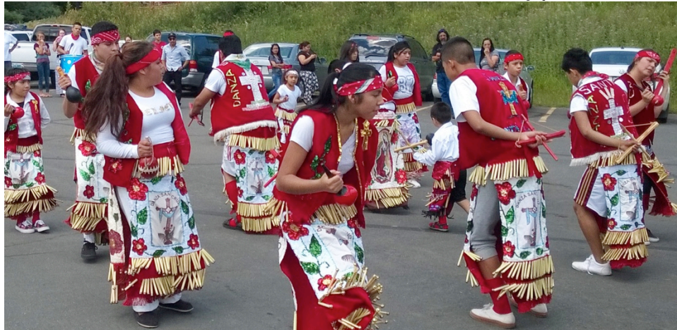
Native dancers added to the festivity and celebration of the Summer Feast!