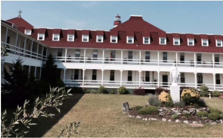
The Cape May lighthouse peeks over the roofline of the St. Mary-by-the-Sea Retreat House where the Come and “Sea” discernment retreat took place.

The vocation directors of NRVC Region 3 (Pennsylvania) just completed a wonderfully uplifting Come and Sea discernment retreat weekend hosted by the Sisters of St. Joseph at the St. Mary-by-the-Sea Retreat House in Cape May Point, NJ.