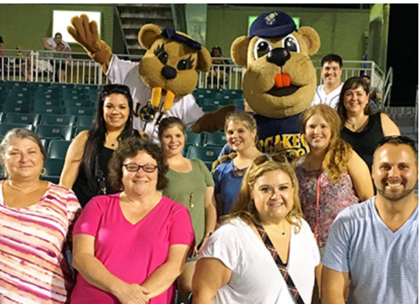
Cabrini alumnae and families attended the New Orleans Baby Cakes baseball game and were joined by Baby Cakes mascots Boudreaux and Clotile.

"To achieve my goals I wanted to get alumnae engaged in social activities first, followed by service and fundraising activities to ensure that we are not only keeping the sisterhood of Cabrini High School strong, but we are putting back into the community what's been instilled in us through our years at Cabrini."