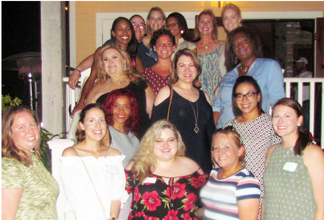
Many Cabrini alumnae kicked off the summer with a fun gathering honoring the Class of 1992 for the 25th Reunion.

Cabrini High School's Alumnae Office has been energetic this summer with new goals and events to foster alumnae engagement, community awareness, and increased alumnae service activities following the values of Cabrini High School.