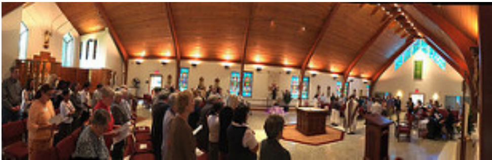
A closing Mass and recommissioning for CMC was held on the campus of Cabrini College this past Saturday.