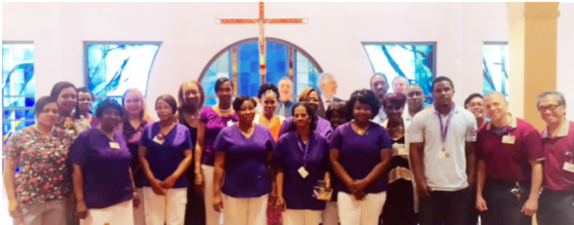
Cabrini of Westchester employees are being recognized for their long term years of service. Thank you for your compassionate care and dedication.