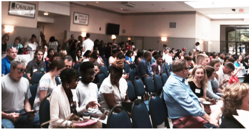
Members of the Cabrini College Class of 2019 attend the BEGINNINGS orientation program with their family members.

While students are immersed in the campus community throughout the course of the day, parents and family members in attendance will also be oriented to various campus resources and learn about how to best collaborate with the Cabrini Community to ensure success. Family members will meet and create relationships with other families of new students and develop a better understanding of how to assist their student with beginning the transition