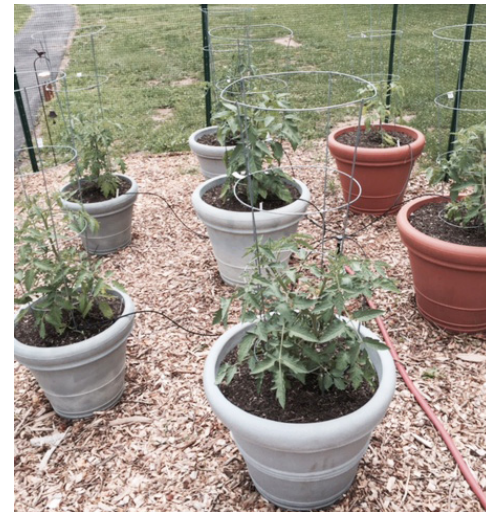
The heirloom tomatoes have grown vigorously since being planted last month.