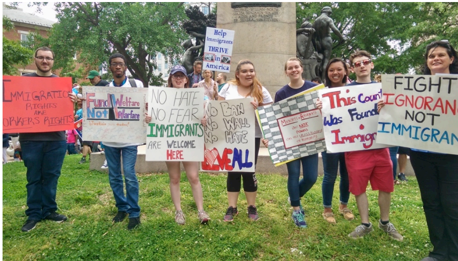
Cabrini University students carry banners as they rally in Washington D.C. for the rights of immigrants.

slogans such as “No Human Is Illegal,” and “Fight Ignorance, Not Immigrants,” and these signs were hung on a barricade constructed on the University Commons for a Border Solidarity Mass celebrated on April 19 to commemorate Pope Francis’s visit to the US-Mexico border the year prior.