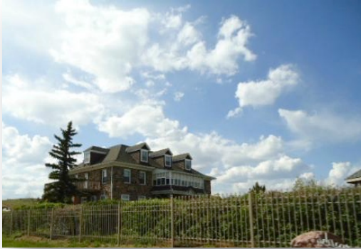
The Stone House