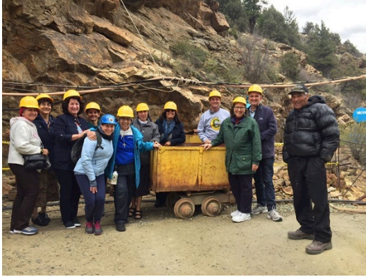
Pilgrimage 2017 – Some members of this year's pilgrimage try their hands at mining for gold.