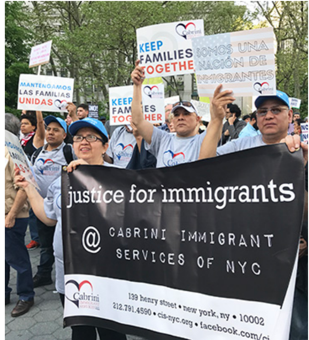
Cabrini Immigrant Services NYC staff and Justice for Immigrant Services members rallied in New York City on May 1 st .