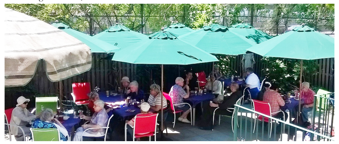
The weather was perfect for dining al fresco. The MSCs gathered on the patio at Sacred Heart Convent for the traditional Memorial Day fare of hot dogs, burgers and grilled chicken.

The Missionary Sisters at Sacred Heart Convent in New York City observed the day in by celebrating with a red, white and blue cookout.