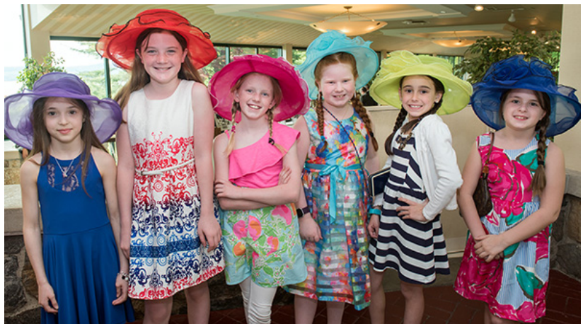
Beautifully dressed young ladies assisted in selling raffle tickets at the 2017 Sharing in Mission Dinner.