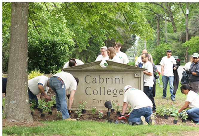
Planting colorful annuals at the front entrance of the College was the task of this team of faculty and staff.