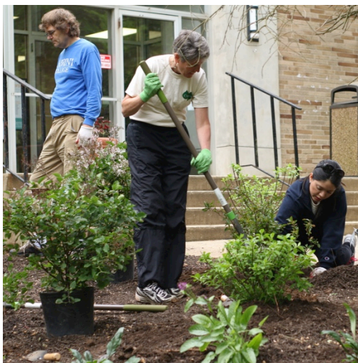
Preparing the soil and digging large holes to receive a variety of shrubs was the charge of the crew outside the Holy Spirit Library.