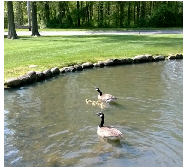
The newly expanded Goose Family glides across the pond at the entrance to Cabrini College.