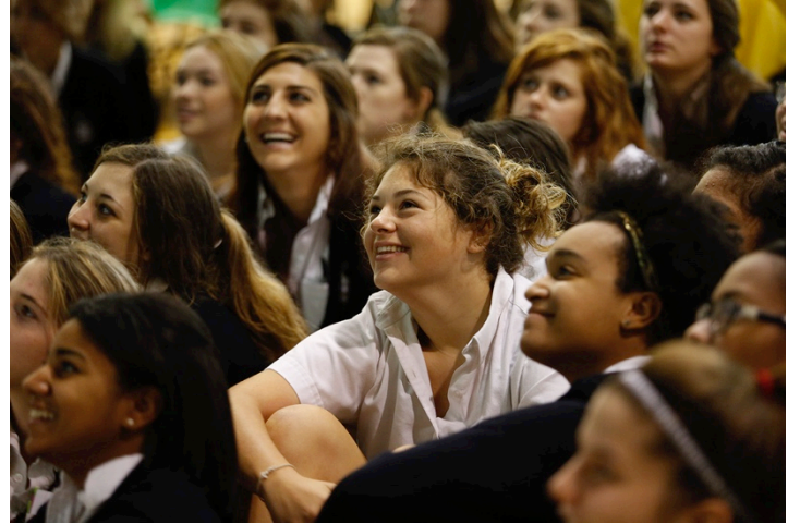
During a special luncheon, Cabrini High School seniors enjoy the commemorative slideshow from their years at CHS.