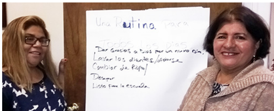
Workshop participants discuss their typical morning parenting routines.