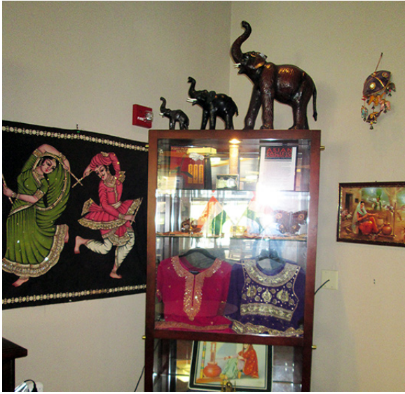
In April, the spotlight at St. Cabrini Nursing Home was on Asian/Pacific American culture.

One of the Committee's goals for 2017 is to bring greater cultural awareness to Cabrini of Westchester. Beginning in January, the Committee and other staff members have contributed to this project with either artifacts for display, information or planning. So far, we have completed three months of displays starting with Black History Month in February, Irish American History Awareness during March, and Asian/Pacific American Month in April.