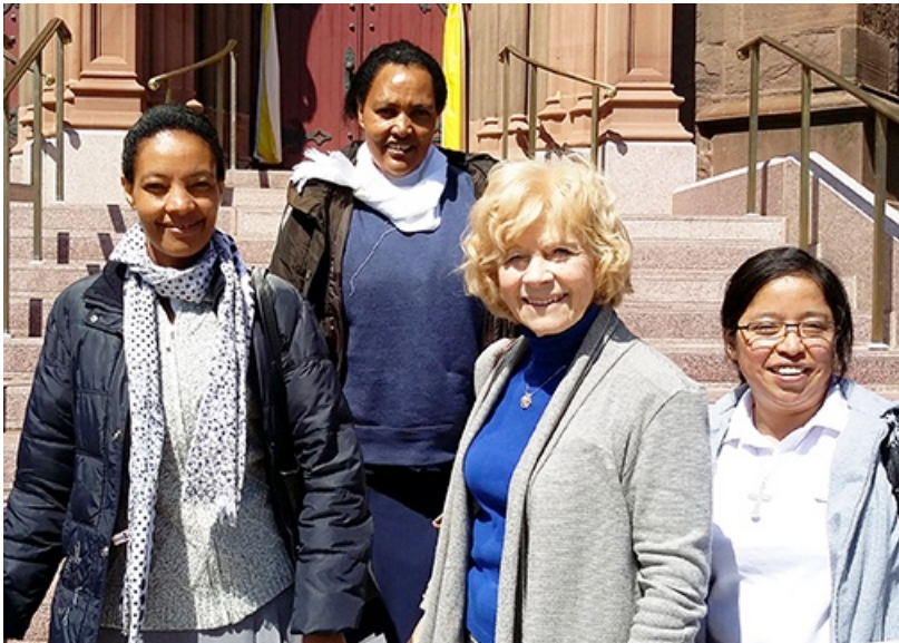
Along with a companion, the Missionary Sisters took time during their day in Albany to visit the Cathedral there.

We were there to express our concern for the life of the unborn and all life from conception to natural death. It was a beautifully productive day. We started our day with the recitation of the Sorrowful Mysteries of the rosary in union with our mission to remember those whose lives have been lost to abortion. When we arrived in Albany we listened to speakers address Physician Assisted Suicide that is being debated this year in the Senate and Assembly.