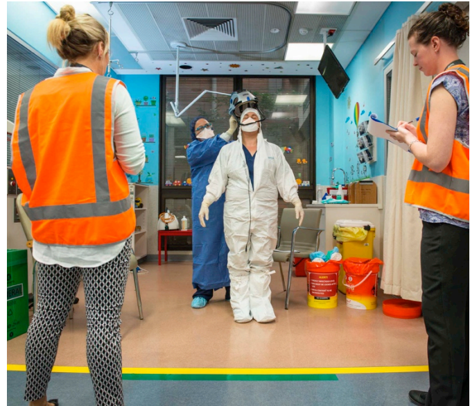
Cabrini Health staff members conduct a simulation exercise in the Cabrini Malvern emergency department to ensure preparedness for a patient who has the Ebola virus or any other contagious infection.

The West African countries of Sierra Leone, Liberia and Guinea are struggling to deal with the large numbers of infected, often dying people. Ebola virus is a member of the viral haemorrhagic fever family and is a highly contagious, spread from person to person through contact with bodily fluids and waste. It is therefore necessary to have such plans in place so that all our health workers, staff, other patients and their families can be confident that they are protected by the most robust infection control possible. ~ submitted by Christine Elmer