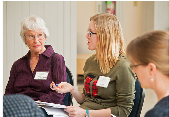
Workshop participants had time during breakout sessions to engage in dialogue about the climate issues.