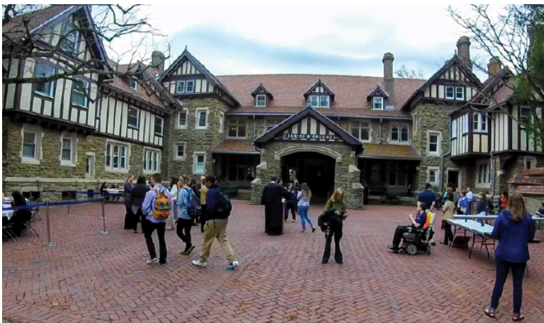
Cabrini College celebrated its 10-year anniversary with CRS by signing another 10-year partnership, as well as by hosting an interactive Refugees Seeking Safety simulation by CRS Ambassadors.

Ten years ago, faculty and administrators at Villanova University and Cabrini College realized that introducing college students to the real world lives of people around the world would help to shape them into engaged and caring citizens.