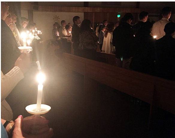
Candlelight services on Holy Saturday.

There was a Reflection on the Seven Last Words Jesus spoke from the cross, followed by the Liturgy of the Passion and the veneration of the cross. The Easter Vigil was celebrated on Holy Saturday with the blessing of fire and water. Easter Sunday Masses were celebrated with crowds overflowing the chapel and into the surrounding area. The 2 p.m. Spanish Mass was very popular also.