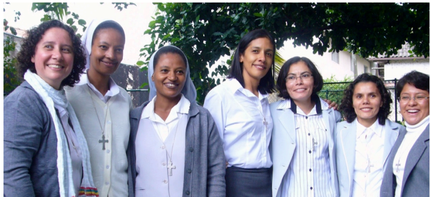
The Missionary Sisters are an international congregation of women religious. The diversity of cultures is a hallmark of the Institute.

"Among the sisters there was such a claiming of sisterhood. There really is this sense that we are all sisters working in the mission of Christ. The college students who got involved were delightful. They found such peer support among other young women who also have this hunger to learn more about sisters."