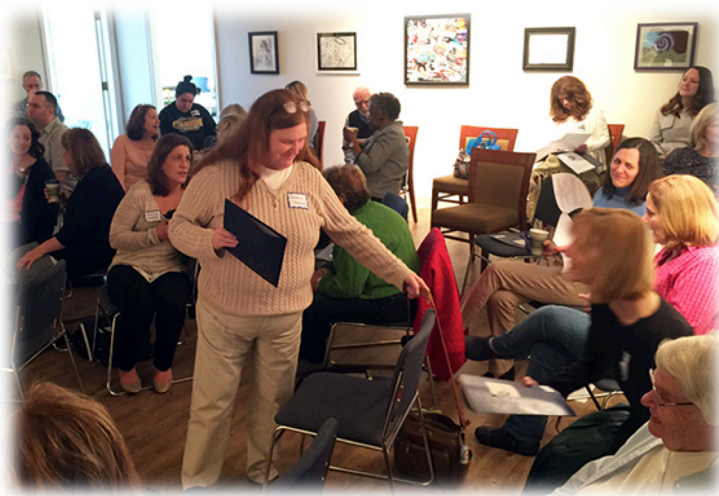
Getting ready for the Day of Prayer are Missionary Sisters and over forty members of the Cabrinian Community.