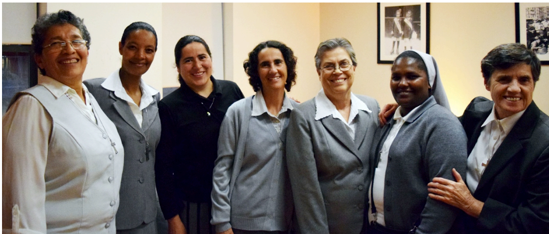
Missionary Sisters from across the Institute were happy to join in the celebration of CIS-NYC.