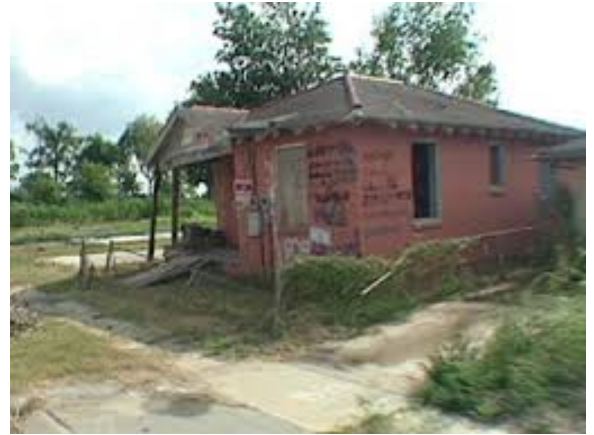
Some houses in the Lower 9 th ward remain broken and abandoned eleven years after Hurricane Katrina.