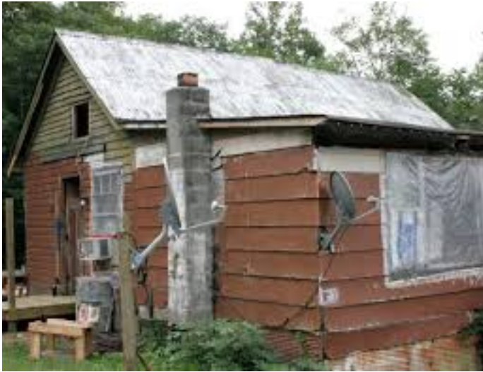
While not the exact home that the Cabrini students worked on, this home is typical of many found in the Appalachian region – in dire need of repair.

College students are known to spend their spring breaks either soaking up the sun or catching up on some much needed rest. Many students at Cabrini College, on the other hand, opt to devote their spring breaks to serving others. The College's mission, which is centered on social justice and compassion, has inspired its students. This spring break, Cabrini students decided to help build and renovate homes in New Orleans and Appalachia, West Virginia. Thanks to their hard work and partnership with other organizations, they were able to bring hope to many.