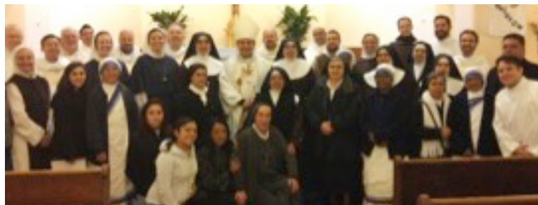
Consecrated religious from 52 congregations and institutes gathered on February 2 nd in Denver to celebrate the World Day for Consecrated Life.