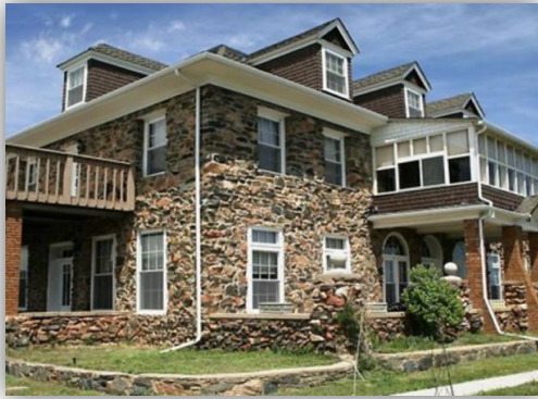
The Stone House