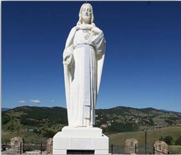
Sacred Heart statue on the Shrine mountaintop